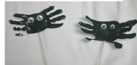
handprint spider puppets